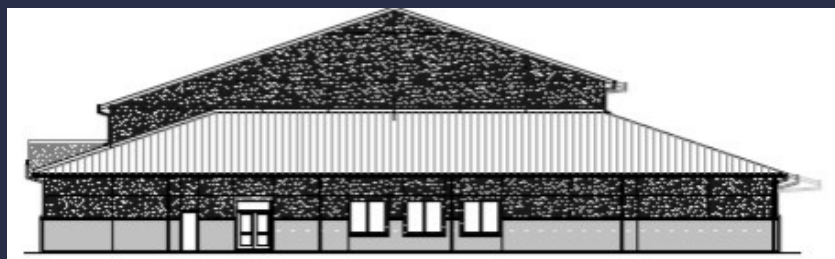
West View (View from Classrooms)