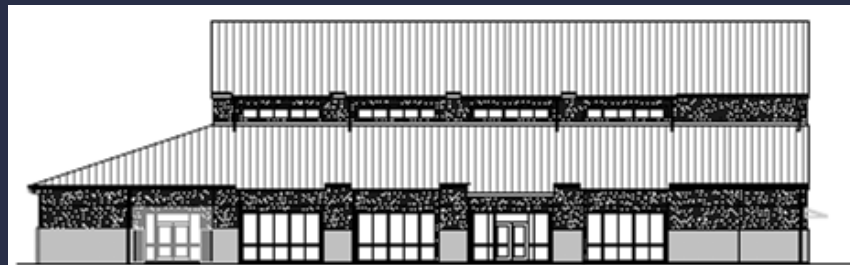
South View (View from Front Entrance/Playground)